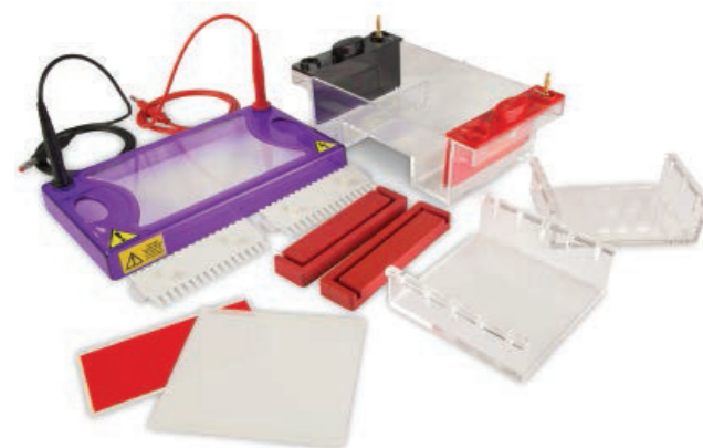
MSMidi complete system